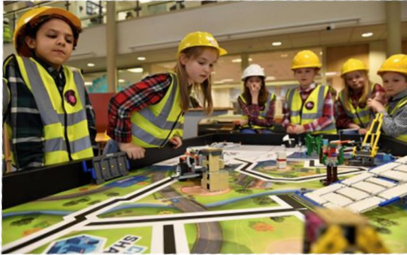
Lego Challenge in Schools