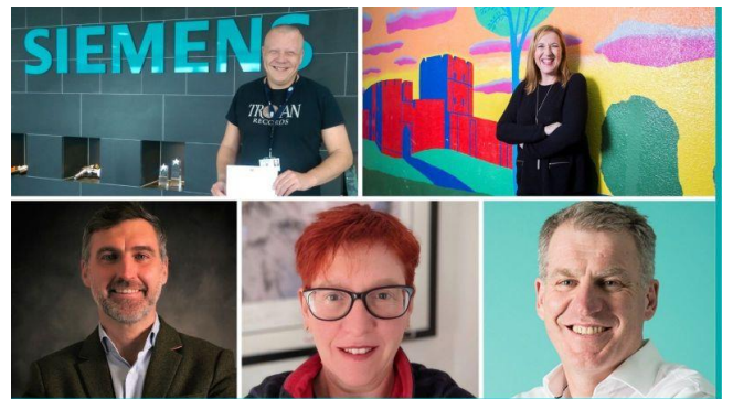
Meet some of our Enterprise Advisors

“To help every young person find their best next step”